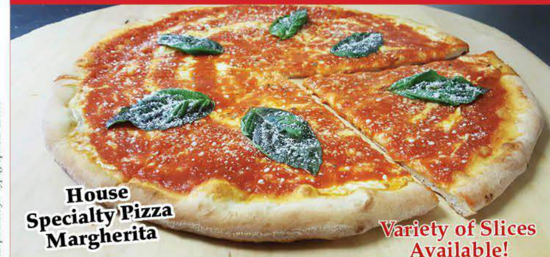
House Specialty Pizza Margherita