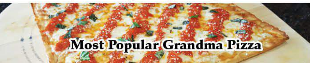
Most Popular Grandma Pizza